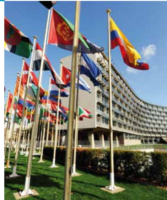
UNESCO Headquarters in Paris

UNESCO's mission is to contribute to the building of peace, the eradication of poverty, sustainable development and intercultural dialogue through education, the sciences, culture, communication and information. UNESCO believes that it is essential to learn about the Holocaust to better understand the causes of Europe's descent into genocide; the subsequent development of international law and institutions designed to prevent and punish genocide; and that the careful comparison with other examples of mass violence may contribute to the prevention of future genocides and mass atrocities.