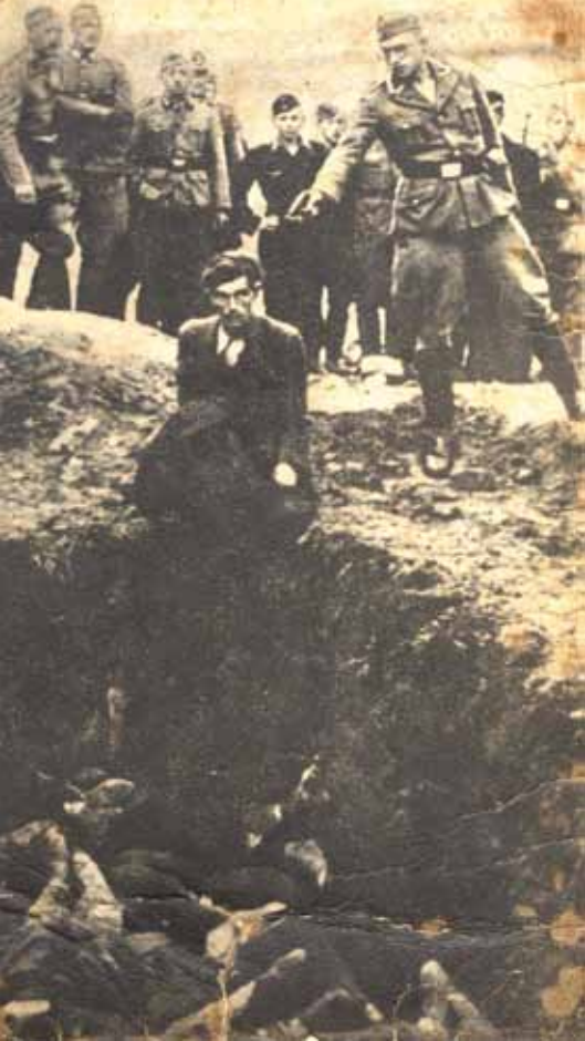
Vinnitza, Ukraine, German soldiers watching an Einsatzgruppen soldier murder a Jew, July 1941

in attacking and almost destroying the Jewish population, not only of Germany but of most of Europe, will raise awareness about the roles and responsibilities of the State, of individuals and of society as a whole in the face of increasing human rights violations. An examination of the actions of German doctors and nurses in the so-called "Operation T4" euthanasia program of Nazi Germany (which led to the killing of more than 200,000 mentally or physically disabled men, women, and children over six years) is another example. Likewise, the participation of regular German soldiers in the killing of over one million Jews as part of the work of the Einsatzgruppen (special killing squads) in the eastern parts of Europe, leads to questioning human behaviour, conformism and the power of ideologies; in short, the adhesion of a society to a government undertaking actions that violate internationally recognized human rights. Educating about the Holocaust can help young people to understand key concepts that will be useful when studying other examples of mass violence. When pupils explore the history of other massive human rights violations, they will be able to draw on their understanding of the Holocaust and become more aware of their own responsibilities as global citizens.